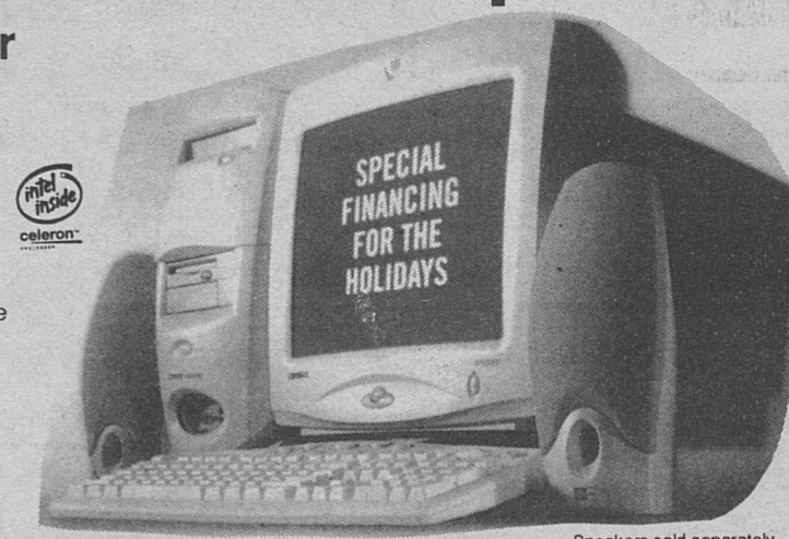
Speakers sold separately.